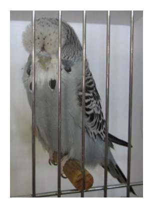
Beginner Bird of Show